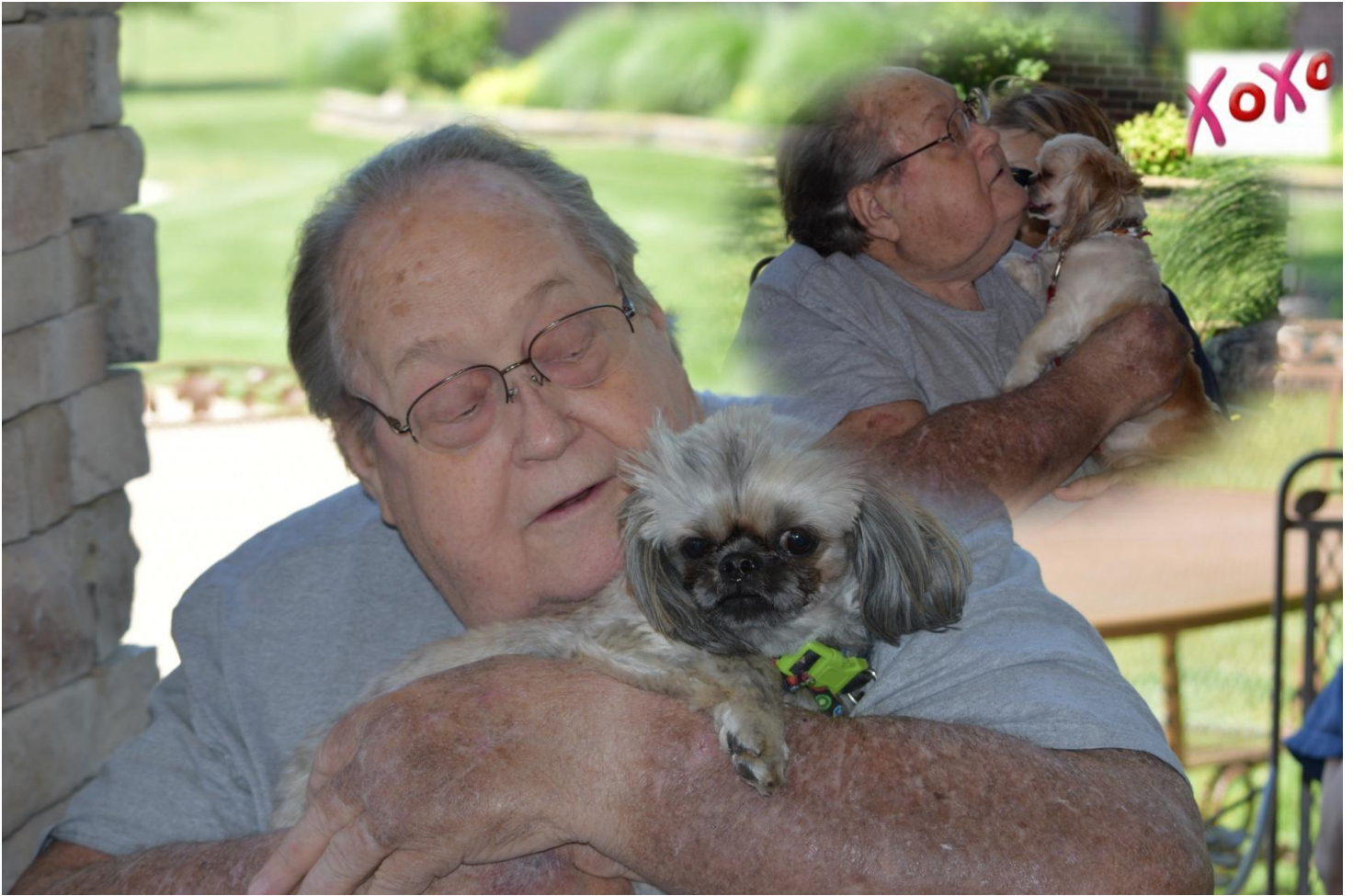
This gentle man held the little puppy throughout the pet therapy session. The two became one!