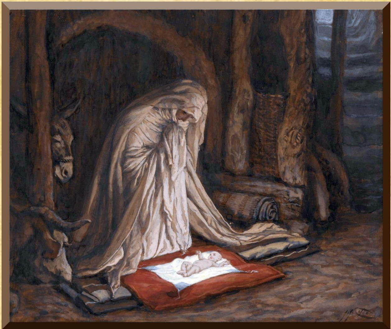
The Birth of Our Lord Jesus Christ “-- by James Tissot

Consequently, our Jewish Messiah’s fate was to be born in the harshest of conditions away from family, and under Roman jurisdiction; all before he uttered one earthly cry.