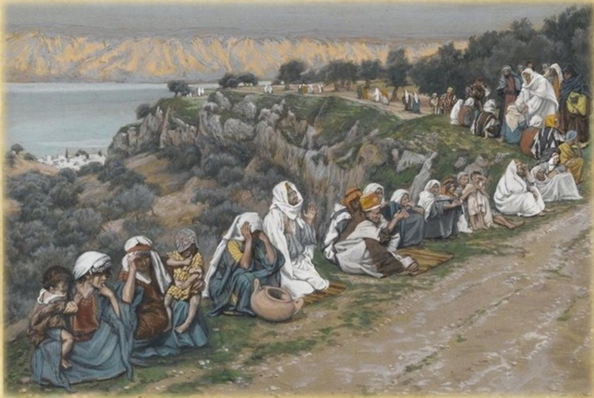
“THE SICK WAITING FOR JESUS TO PASS BY”, by James Tissot

Thus, the actions of Jesus are best described by reading from the book of Isaiah 42: 3; the scroll Jesus had not only memorized as a child, but read aloud in the synagogues upon many occasions; words that lived in the heart of Christ as evidenced by his consistent behavior during his time on earth. “A bruised reed he will not break, and a smoldering wick he will not snuff out.” ( Life Study Bible, New International Version )