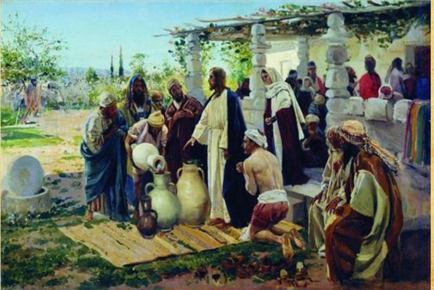
Marriage-at-Cana by Vladimir Makovsky 1887