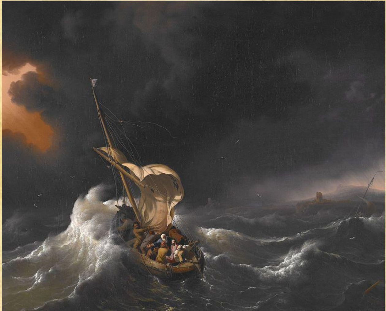
Bakhuizen, Ludolf – "Christ in the Storm on the Sea of Galilee - 1695" by Ludolf Bakhuizen

(Note how the artist captured the violence of the storm)