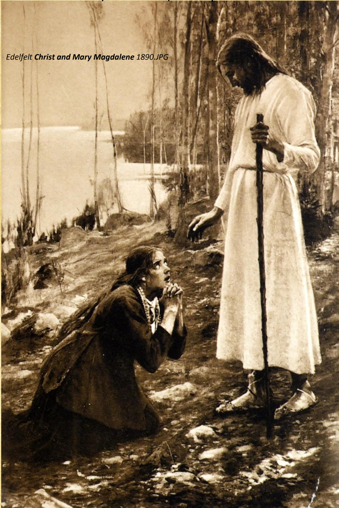
Edelfelt Christ and Mary Magdalene 1890.JPG

in the oldest strata about Jesus--the earliest traditions that circulated before they were collected and edited by the evangelists." Unlike now, people living during the time of Christ believed that miracles were symbolic of the supernatural power of God.