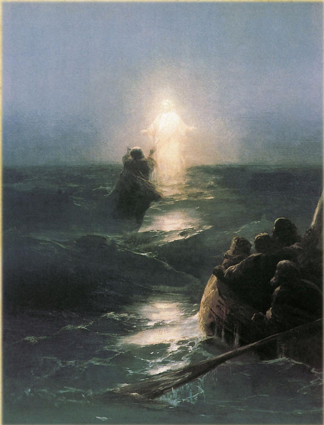
Jesus walks on water, by Ivan Aivazovsky (1888)