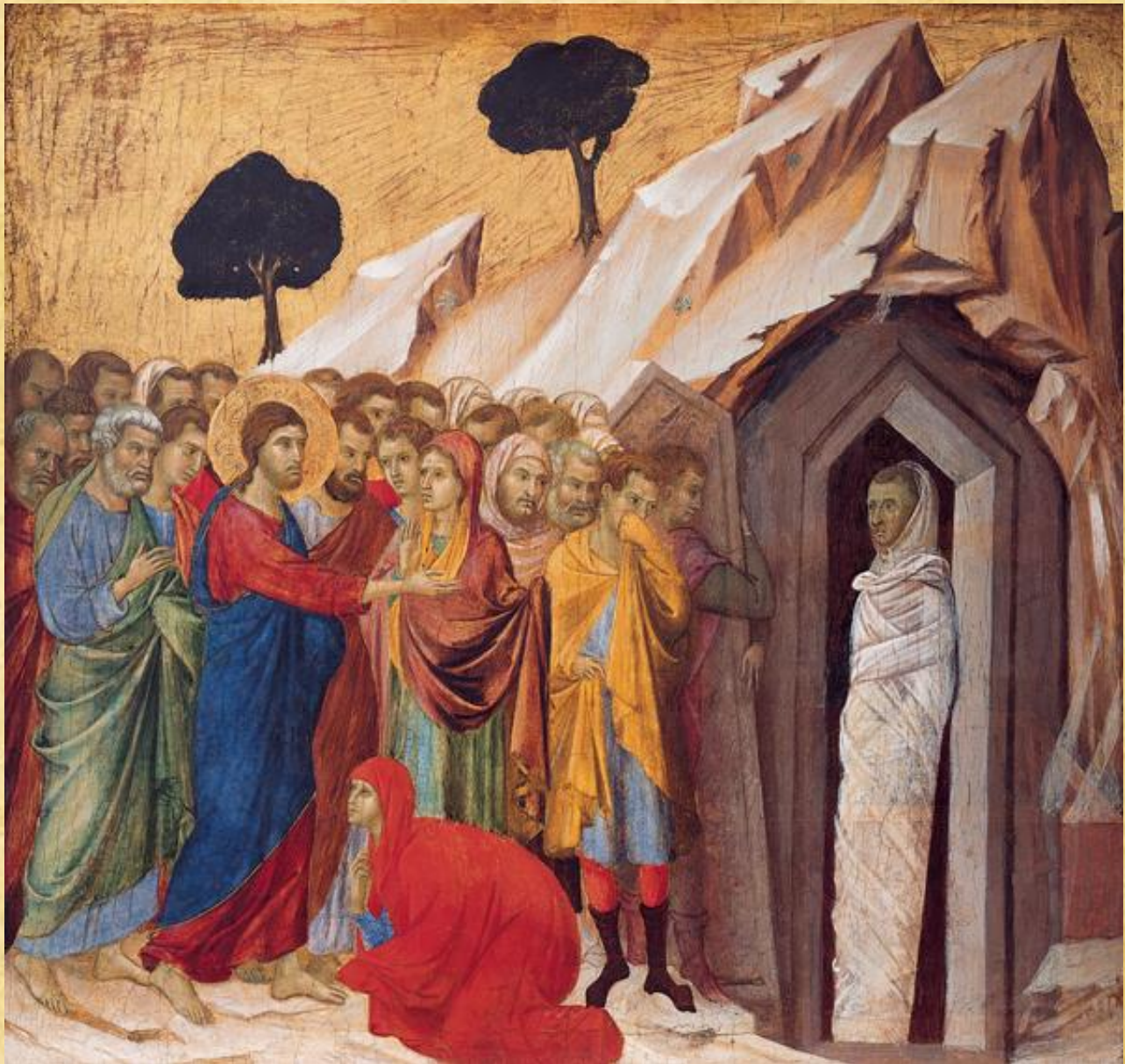
The Raising of Lazarus, by Duccio, 1310–11