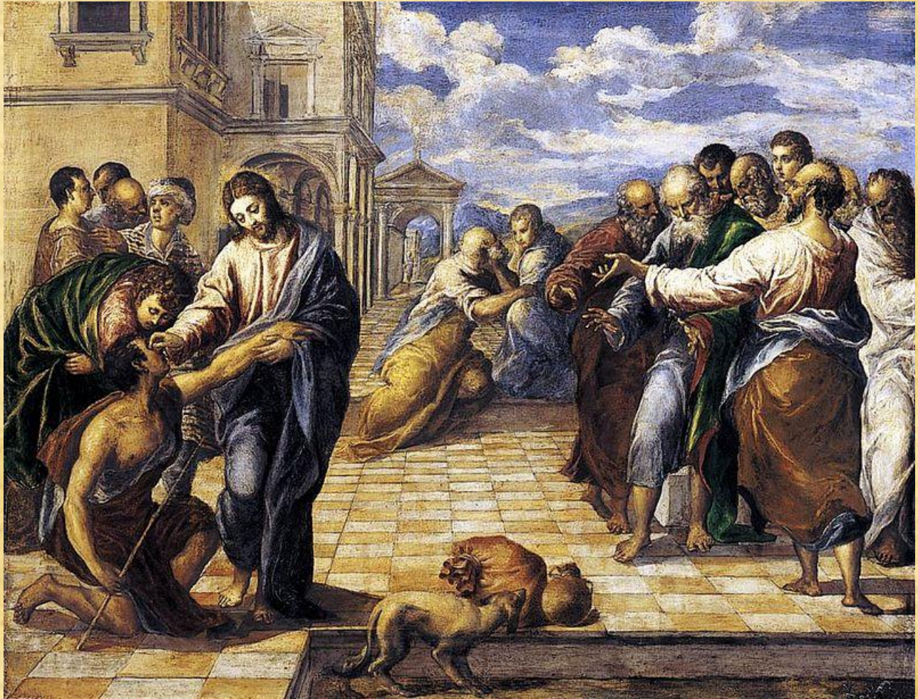
Healing the Man Born Blind by El Greco, ca. 1570 (Staatliche Kunstsammlungen, Dresden).