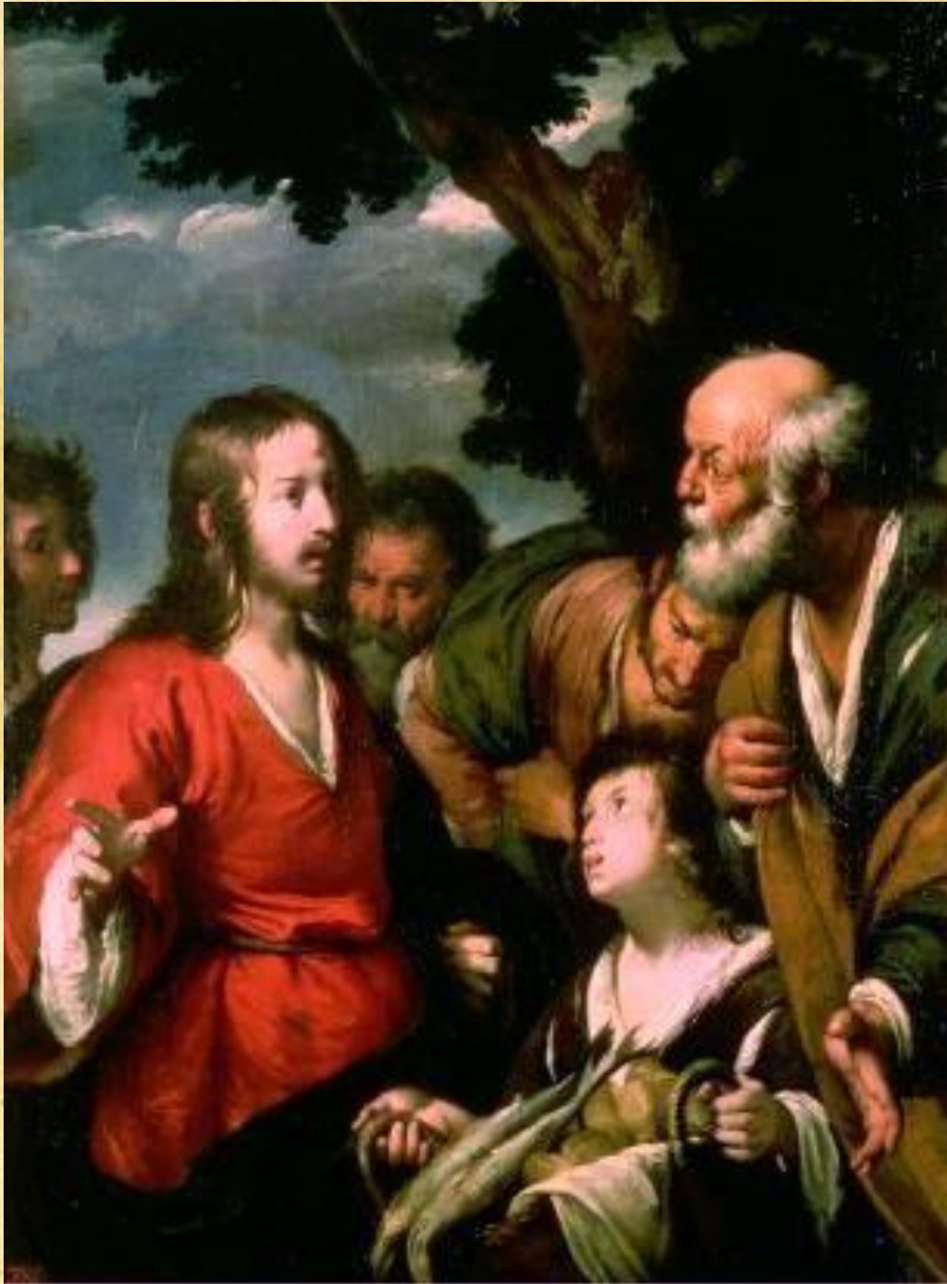
Feeding the multitudes by Bernardo Strozzi , early 17th century.